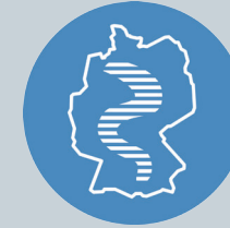
Federal Sectoral Planning/Regional Planning