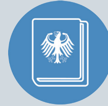
Federal Requirements Plan